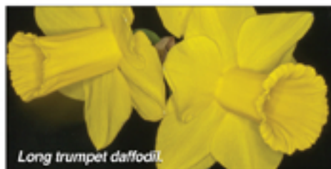
Long trumpet daffodil.