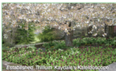
Established Trillium 'Kaydale's Kaleidoscope'